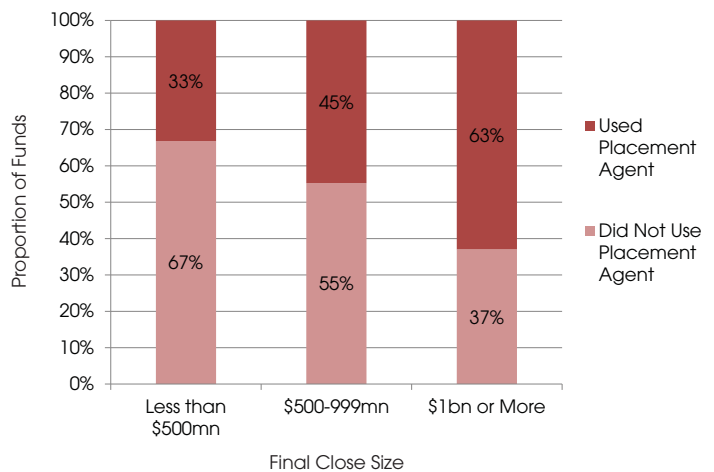
Fig. 2: Proportion of Funds Using/Not Using Placement Agents by Fund Size, Funds Closed 2012 – 2014 YTD (As at 20 May 2014)